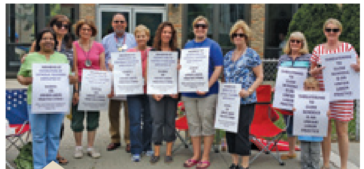
Strikers stand united at Sacred Heart elementary and middle school in Hartsdale, New York.