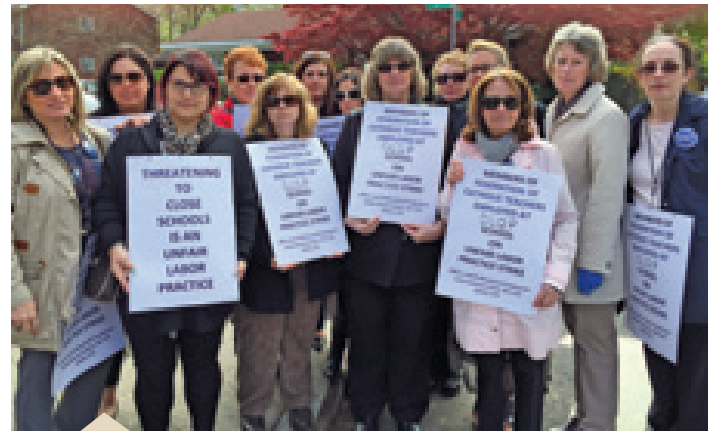
Striking teachers demonstrate at Our Lady Queen of Peace elementary and middle school in Staten Island, New York.

“We are striking to save Catholic schools,” she continued. “It is unfair for our members – and Catholic school students – to be threatened with more school closings simply because we are engaging in our legal right to bargain collectively. Pope Francis said school teachers are grossly underpaid. It’s too bad the Archdiocese doesn’t realize the Pope is right about this.”